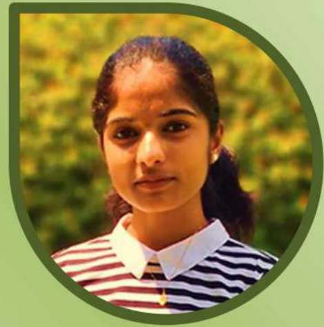
ARDHRA A T